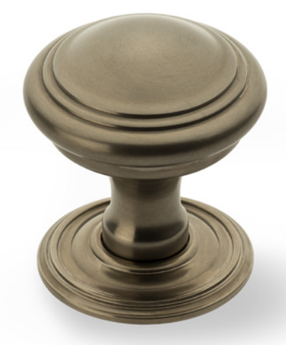
SNB Satin Nickel - Bronzed

Occasional cleaning with a metal polish followed by a light application of a good quality wax will assist in maintaining the finish in good condition.