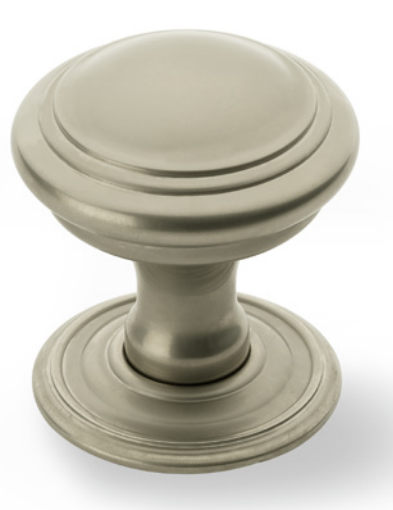
PRL Pearl Nickel

Occasional cleaning with a metal polish followed by a light application of a good quality wax will assist in maintaining the finish in good condition.