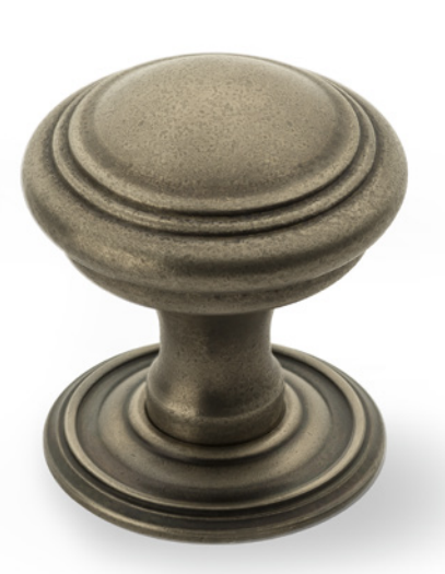
AND Antique Nickel - Distressed

A light application of a good quality wax will assist in maintaining the finish in good condition. Do not use solvents, cleaning chemicals or abrasive products with this finish.