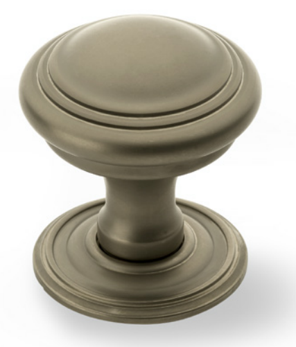
MBN Matt Black Nickel

A special matt nickel plate on top of a sateen polished solid brass surface, producing a non-reflective smoky effect. Unlacquered nickel plated finishes are less durable than chrome plated ones and, as such, should be considered living finishes - which will gradually oxidize over time. It can be cleaned occasionally with metal polish, if preferred, to maintain the original finish.