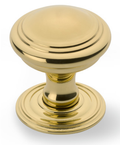
PBU Polished Brass

A light application of a good quality wax will assist in maintaining the finish in good condition. Do not use solvents, cleaning chemicals or abrasive products with this finish.