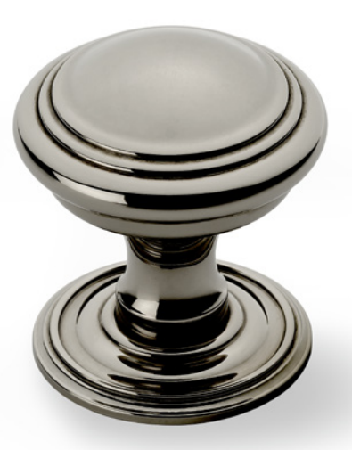
PBN Polished Black Nickel

Occasional cleaning with a metal polish followed by a light application of a good quality wax will assist in maintaining the finish in good condition.